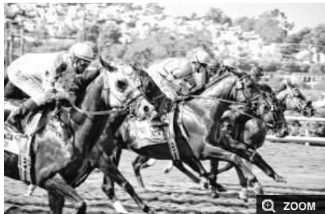
Catch the excitement of Del Mar's races, July 20-Sept. 7.

plan to be there for closing day festivities on Sept. 7. In between, it is always in style to don a hat, but try to catch a Friday night concert