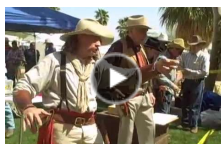
Fast-Draw Wild West Shootout